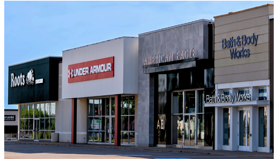
5950 Rodeo Dr, Mississauga, ON L5R 3G5