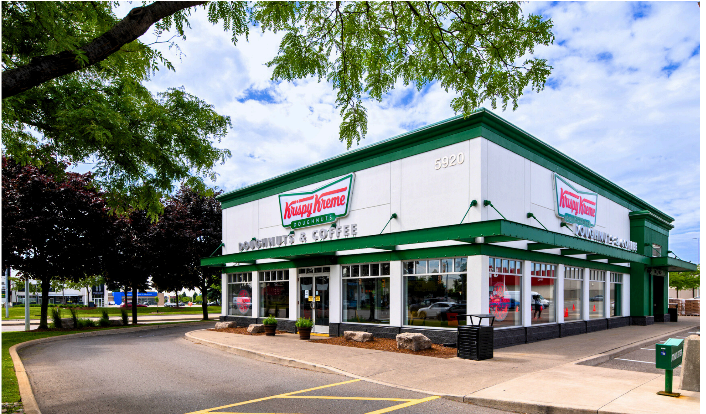
5920 Mavis Rd, Mississauga, ON L5V 2P5