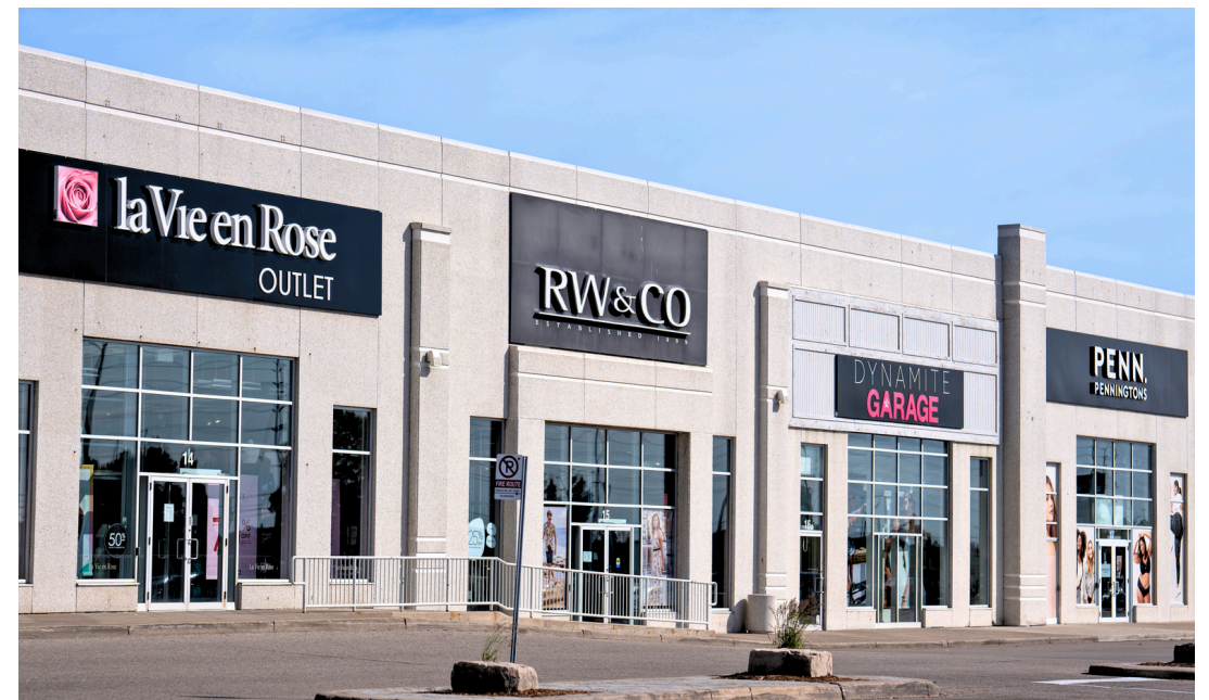
6075 Mavis Rd, Mississauga, ON L5R 4G6