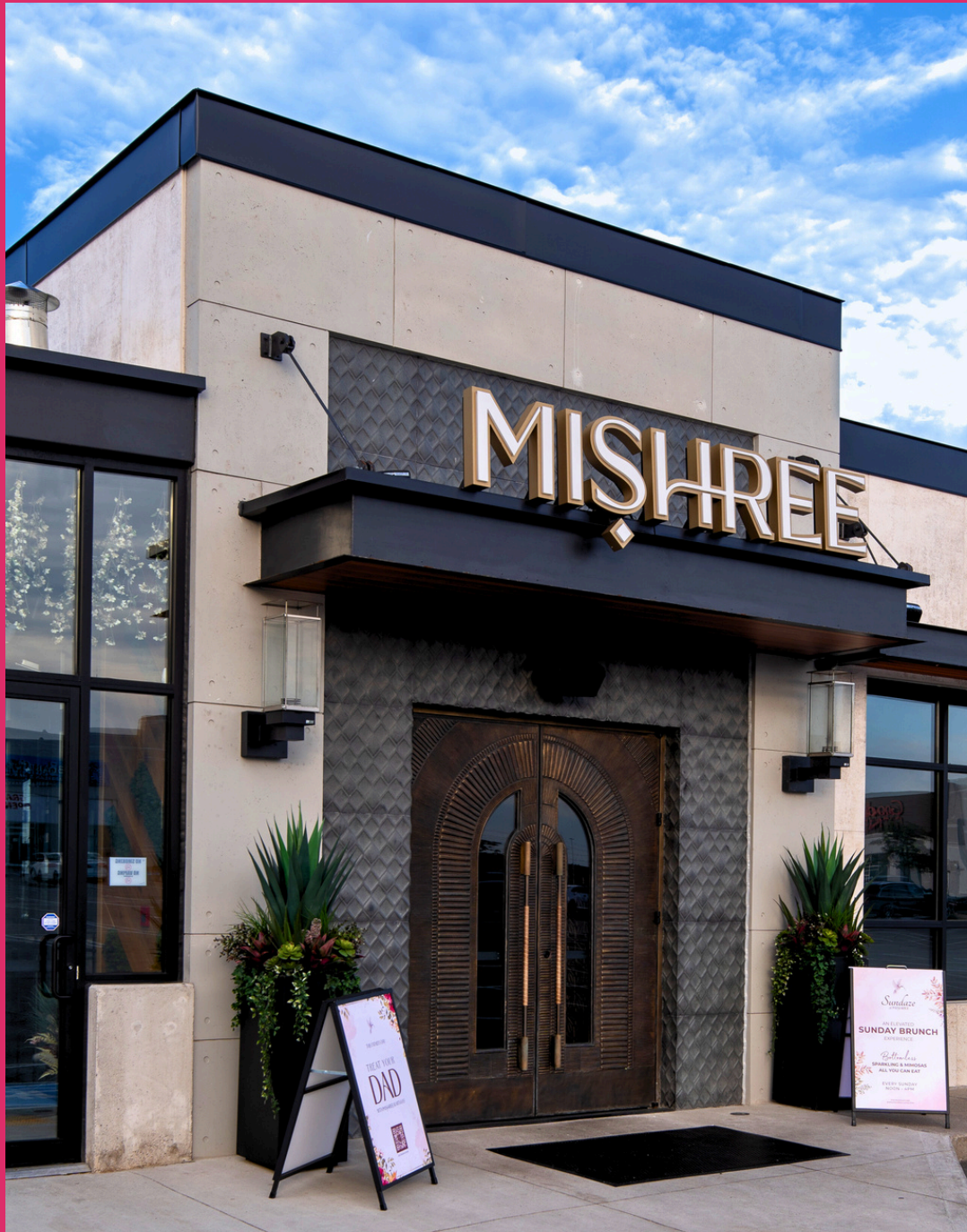
825 Britannia Rd W, Mississauga, ON L5V 2X8